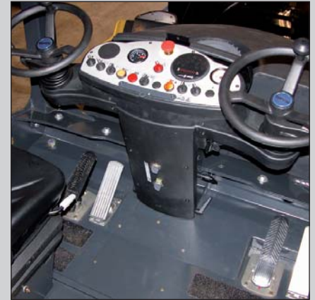
Two complete operator platforms with swivel/sliding seat make work more efficient and give good visibility.

The BW 25 RH BOMAG roller can be adjusted to provide the specified weight for the job. To achieve this, different ballasting options are available. The roller can be pre-ballasted with individual weights (attached under the frame). The large ballast space (approx. 3.5 m 3 ) is usually filled with sand or steel scrap for flexible weight adjustment. With the watertight, welded frame option, the rollers can also be ballasted with water.