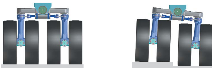
Even weight distribution on each tyre.