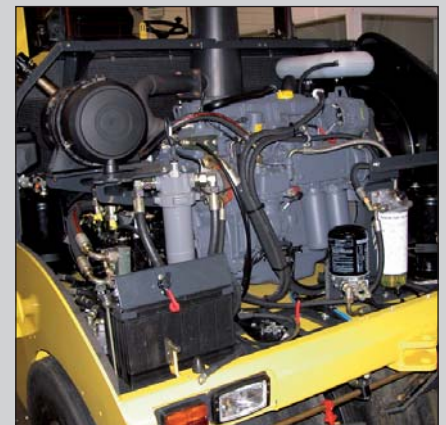
Easy and quick to service: The engine is easily accessible from all sides.