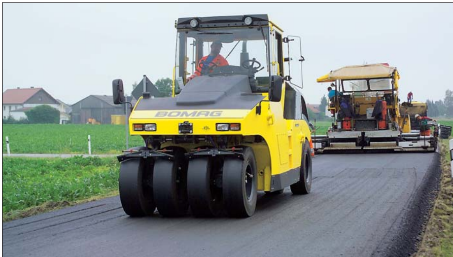
The BW 25 RH is a flexible pneumatic tyred roller for compaction work in asphalt and earthworks.

Pneumatic tyred rollers achieve a high level of compaction quality from the kneading and rolling effect of the wheels. Highly uniform compaction is produced which also gives a dense finish at the surface. The heavy weight of the roller (up to 25 t) generates a vertical pressure combined with horizontal forces acting in all directions beneath the tyres.