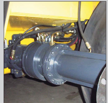
Sensitive speed control using a hydrostatic drive.